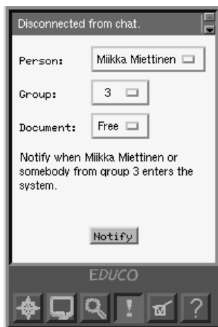
Figure 3. Alarm view.

Finding team members to complete an assignment is often obligatory in SCL. When searching for a companion for group work, regular search is useless unless a student already knows the person he or she is willing to team up with. However, another type of search can be used for the purpose. EDUCO's alarm offers each user a possibility to set "triggers" into the documents, groups and the overall system. In other words, a user can set EDUCO to alert when certain conditions occur. This feature is useful in a case where a user searches for a companion (possibly from a certain group) showing interest for a certain document or topic, or wants to contact a particular person when he or she enters the system. The alarm function also enables making combinations of triggering events. Figure 3 shows an example of a combination of triggers: the alarm will go off if "Miikka Miettinen" or "somebody from group 3" enters the system.